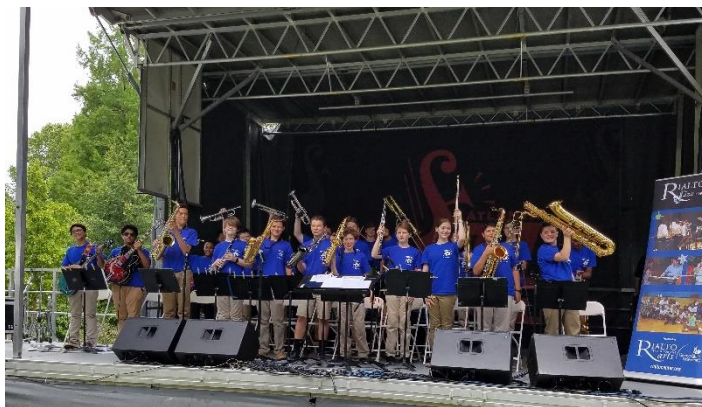
Rialto Jazz for Kids All Stars perform at the Atlanta Jazz Festival