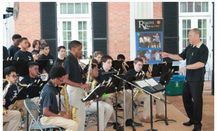
The Jazz for Kids All-Stars performing at the Governor's mansion this summer.