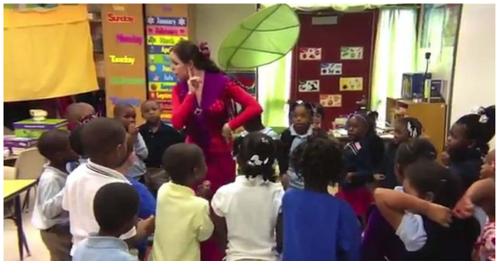
Rialto2Go recently featured Flamenco Dancers at Perkerson Elementary